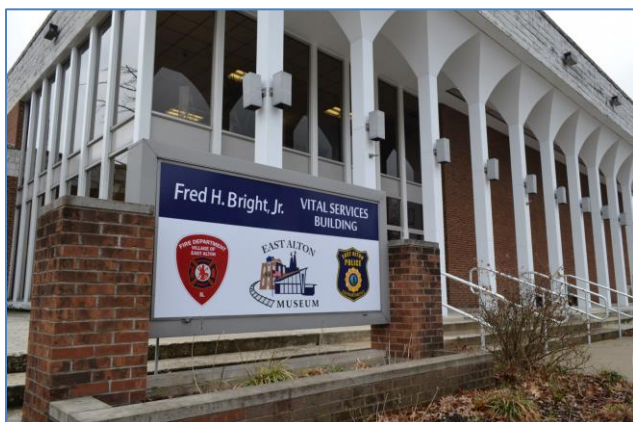
East Alton Vital Services Building